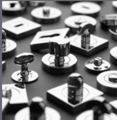
ESCUTCHEONS TURN & RELEASE SETS