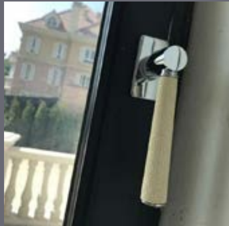
WINDOW FITTINGS / HANDLES