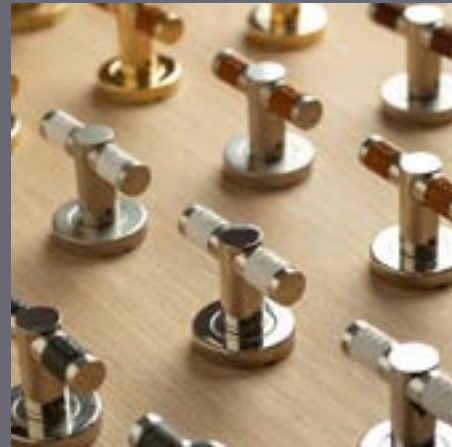
T BAR DOOR PULLS